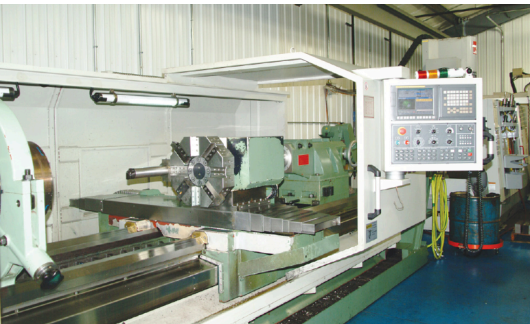
Kingston CK 3000 CNC lathe set up with a roll body ready for machining.

While the current manual equipment provided sufficient capabilities for the company's present jobs, there were difficulties and limitations that needed to be overcome. These included time issues such as setup and tool change, as well as the constant need for dedicated, experienced operators to ensure consistent part quality. In order to overcome these challenges and at the same time grow their capabilities, Touchdown Machining turned to CNC machines.